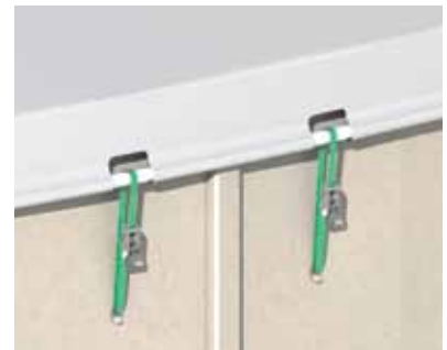
EDGE TUBE SYSTEM WITH RATCHES FOR TENSIONING