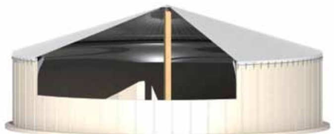
SILOCOVER ON CONCRETE ELEMENT SILO